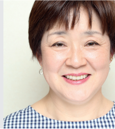
Fig. 14: Compared with the initial situation, the patient looks clearly younger and happier.

started. The result after divesting matched the requirements. Even fine details of the wax-up were exactly reproduced (Fig. 9). The dentures fitted the models accurately and required only minimal reworking.