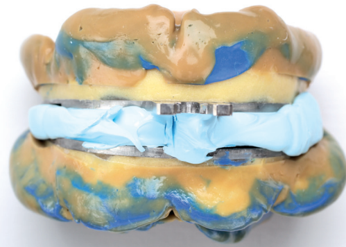
Fig. 5: Customized impression tray and registration device form a unit.

The Angle Class III malocclusion can be clearly seen on the articulated models (Fig. 4).