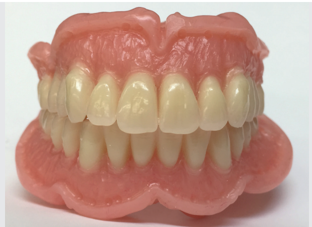
Fig. 9: Dentures prior to soft tissue customization