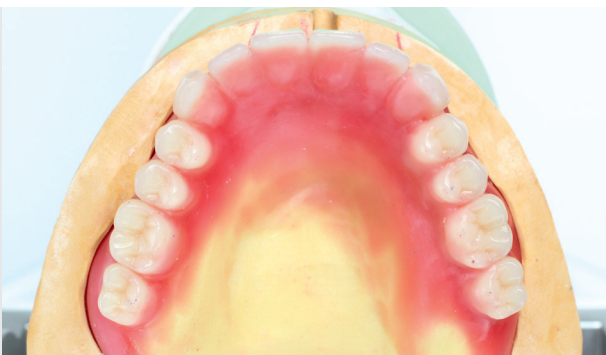
Fig. 6: Setting up the maxilla: the premolars are positioned closely to the alveolar crest.

Designed for classic occlusal schemes, the SR Phonares® II moulds are ideally suited for complete dentures. The facial meter (alameter) integrated into the SR Phonares II FormSelector assisted in selecting the moulds that were best suited for our patient. The teeth were set up in line with the set-up criteria for the classic occlusion. To prevent the flabby ridge from allowing the denture to move, the upper premolars were positioned close to the centre of the alveolar ridge (Fig. 6). We decided to place premolars in the dorsal area of the mandibular arch to achieve an external seal with the buccal mucous membrane and the lingual wall at closed mouth position (Fig. 7). The requirements of function and stability and patient specific characteristics were considered in the tooth set-up. The patient was in the habit of chewing food with her anterior teeth because of her Angle Class III malocclusion. This should be avoided in the new dentures by providing enough freeway space between the anterior upper and lower teeth at the set-up. A great deal of attention was