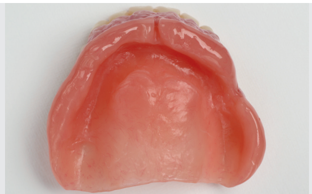
Fig. 12: View from the reverse side: the broad functional margin in the labial vestibule prevents the denture from shifting.