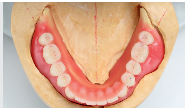
Fig. 7: Setting up the mandible: premolars are also used in the dorsal area.