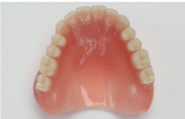
Fig. 11: Completed maxillary denture

The denture wax-ups were flaked and sprued (Fig. 8). Once the moulds were created and the wax was boiled out, the flasks and teeth were prepared for the injection moulding process. The predosed denture base material was mixed and the capsules containing the mixed material and the flask were mounted on the injection device (Ivobase Injector). Once an appropriate program was selected, the injection process