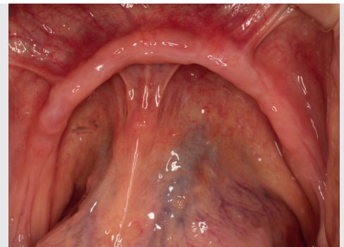
Fig. 3: Asymmetrical alveolar ridge progression in the mandibular arch