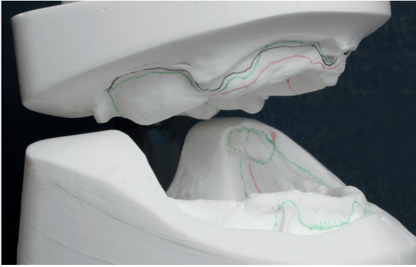
Fig. 4: Articulated models: Angle Class III malocclusion is clearly visible.