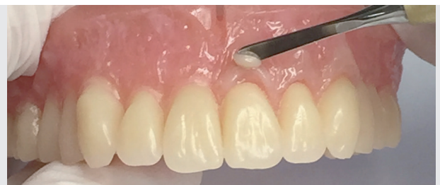
Fig. 10: The interplay of different shades of lab composite (SR Nexco) results in a three-dimensional depth effect. Morphological aspects are also considered in the customization of the soft tissues.

given to faithfully mimicking the natural oral soft tissues, as we wanted to provide a maximum level of esthetics already at the try-in stage. Five different shades of wax were used for characterization. By creating vestibular gingival portions that have a delicate yet effective appearance, the customized look can be accentuated. Esthetics, phonetics, occlusal vertical dimension and centric relation were assessed at the try-in of the wax-up and rated as good.