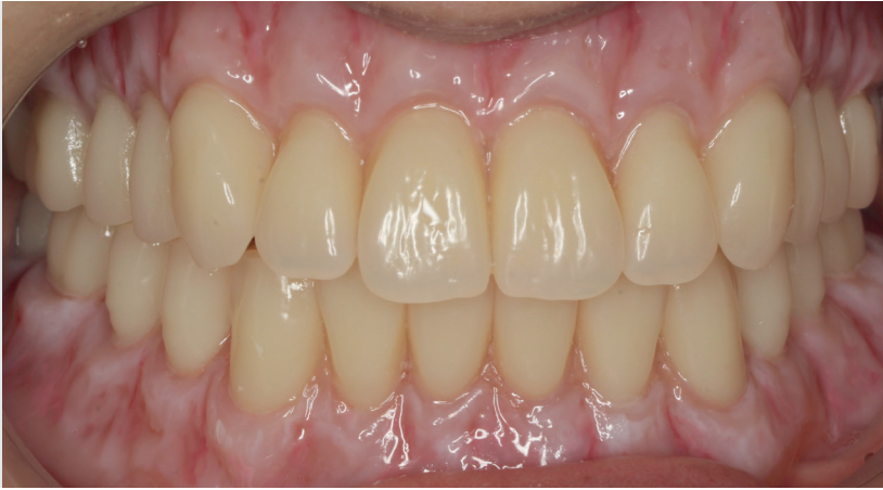
Fig. 13: Customized denture in situ: It's hardly noticeable that the patient is wearing conventional full dentures.